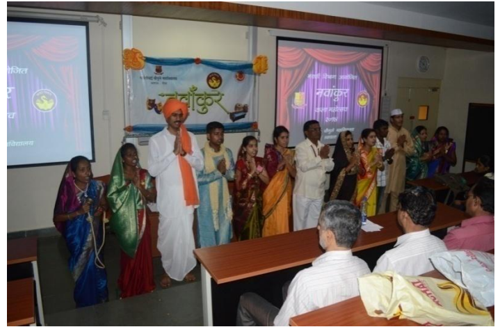
'Navankur Kalamatshotsav 2014'