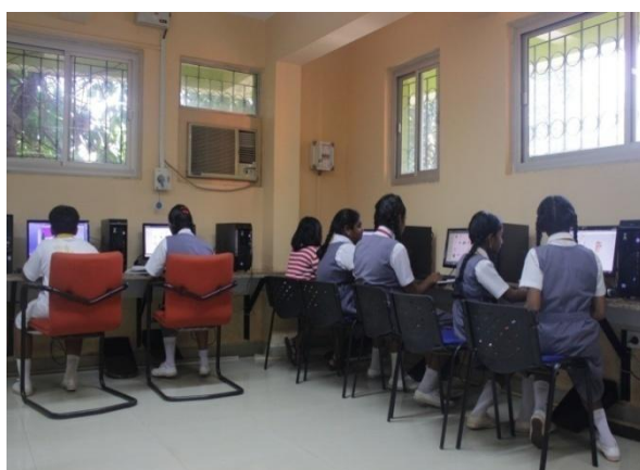
“Hour of Code”

Chapter and ACM Goa Professional Chapter conducted “Hour of Code” (HOC) held at Parvatibai Chowgule College of Arts and Science on 10 th December, 2014.