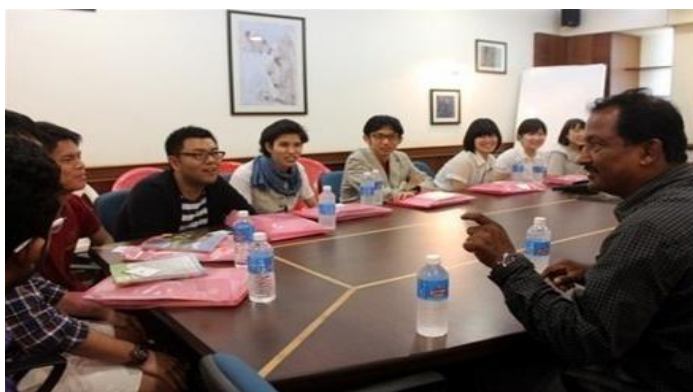
Exchange Programme with Waseda University, Tokyo, Japan

Following are the Exchange Programmes that were conducted by the college: