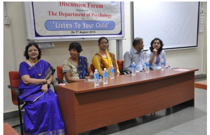
Talk on Listen to your Child