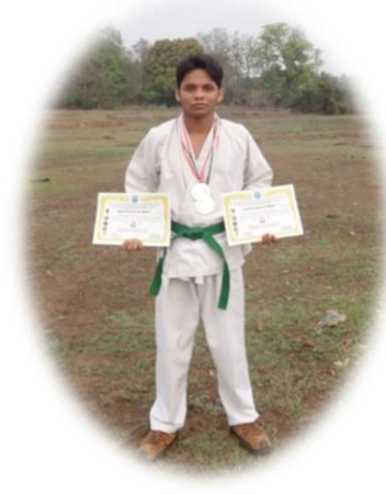
State Chamionship in Karate