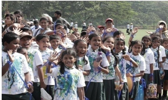
Tara Trust programme