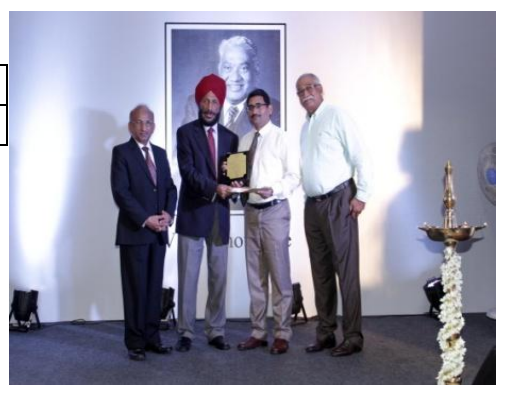
Award for Excellence in Reaserch and Consultancy

3.18 No. of faculty from the Institution who are Ph.D Guides and students registered under them