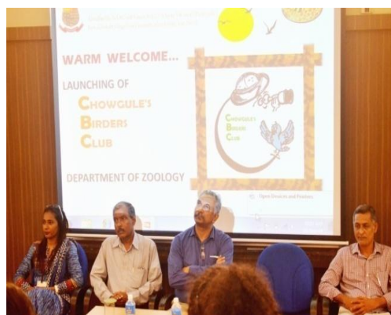
Launching of Birders' Club