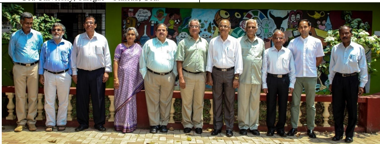
Members of the Governing Body