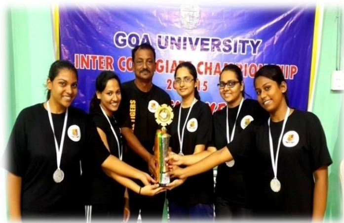
Inter-collegiate winners in Table Tennis

Cultural: State/ University level National level International level