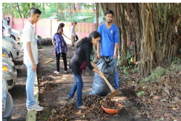
Campus cleaning activity

NSS Volunteers prepared paper bags and distributed them in their nearby markets to create awareness about use of eco friendly paper bags.