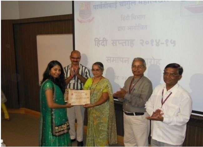
'Hindi Saptah 2014'