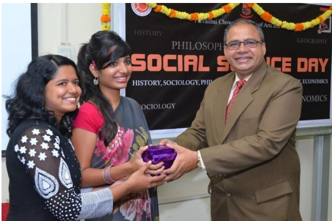
Social Science Day