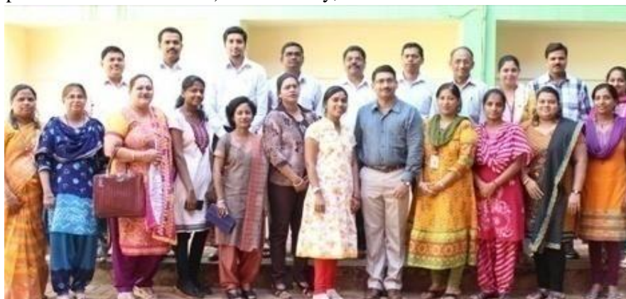
State-level Geography Teachers' Convention