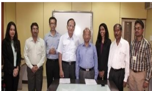
LEXCODE Regulatory Compliance Technologies Pvt. Ltd.

The college has signed Memorandum of Understanding (MOU) with reputed colleges and universities, international and national. They are as follows: