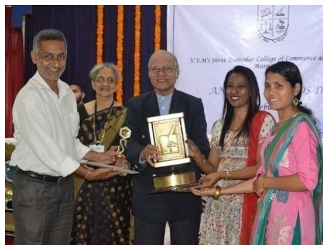
'Best College Magazine'