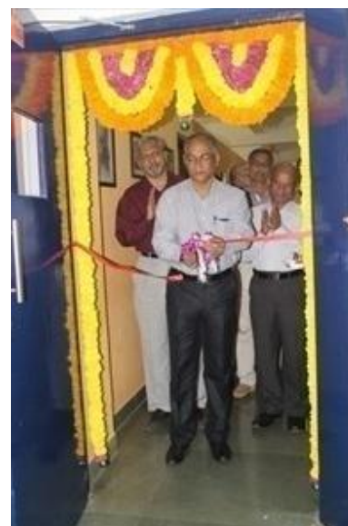
Inauguration of Chemistry lab

The college has been encouraging and promoting research amongst the faculty by allowing them to attend, organize and present research papers in seminars, conferences, workshops etc. Presently 41 faculty members have attended seminars/conferences ( Annexure VIII ) of which 39 faculties have presented their research papers ( Annexure X ) and 12 faculties have been resource persons for such seminars/conferences ( Annexure XVI ). The college departments have also organised 15 seminars/conferences ( Annexure IX ). Total paper publications were 15 of which 9 publications were in peer reviewed journals ( Annexure XI ).